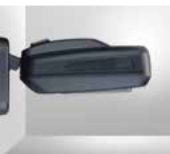
Locking Mount Bracket