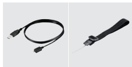
USB Cable Wrist Strap