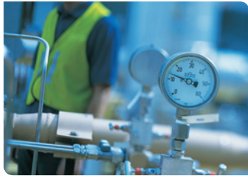
Field Force Automation