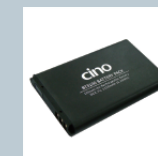
Battery: 1150mAh 2300mAh