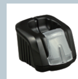
Smart Cradle Charging Cradle