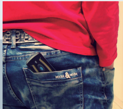
Compact Form Factor

Cino Bluetooth pocket scanner's holding grip matches the contour of worker's hand perfectly and its scan angle is specially designed to meet human factors engineering. The ergonomics minimizes worker's fatigue, allowing extended use for scan-intensive operation.