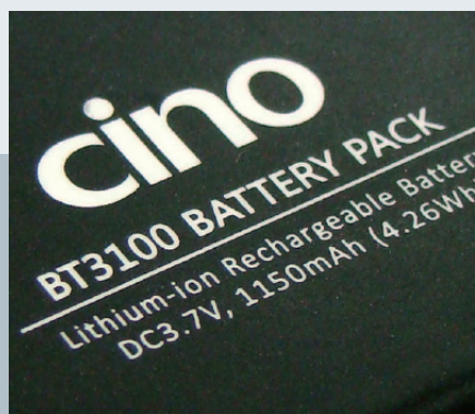
Efficient Power Management

Besides Smart Cradle, Charging Cradle is also available for PA670BT. The smart cradle presents an instant cordless migration and the charging cradle provides a reliable battery charging. Thanks to the special designed mounting holes, the cradle can be flexibly linked together to form a multi-slot cradle by a small hard plate. There is no additional cost for customer obtaining a Multi-slot Cradle Solution .