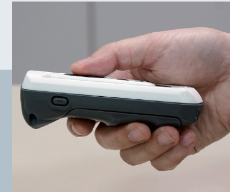
Ergonomic Outer Shell