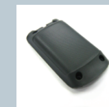
Battery Cover (for 2300mAh)