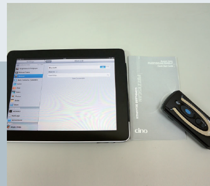
Multiple Radio Link Modes