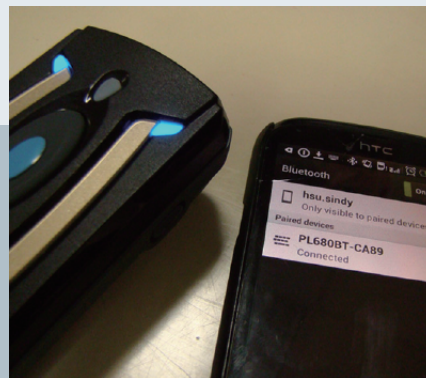
Bluetooth v 4.0 Technology

If the Bluetooth function is not available in your host equipments, Cino Bluetooth pocket scanner can work with smart cradle in peer-to-peer mode (PAIR) or multiple-connection mode (PICO) as a "Plug-and-Play" cordless solution. The PICO mode allows one smart cradle to connect up to 7 scanners simultaneously, and you can enable pre-assigned ID transmission format to identify the source of transmitted data.