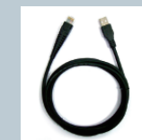
Cable: USB PS/2 RS232 Micro USB