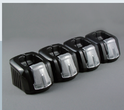
Multi-slot Cradle Solution