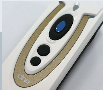
User-friendly Function Keys