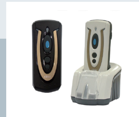
Smart Cradle Solution